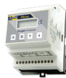
Microx Oxygen Analyzer