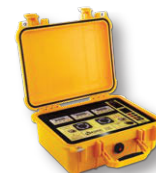
Yellow Box Portable O 2 Analyzer