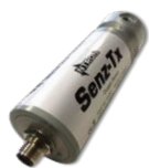
SENZTX Oxygen Transmitter