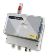
Microx-OL Online Oxygen Analyzer