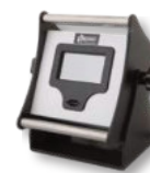
GazTrak Portable oxygen & moisture measurement