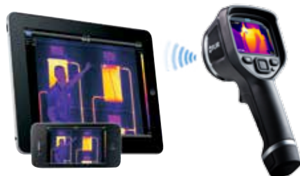
Wireless Connectivity to Smartphones, Tablets and more.