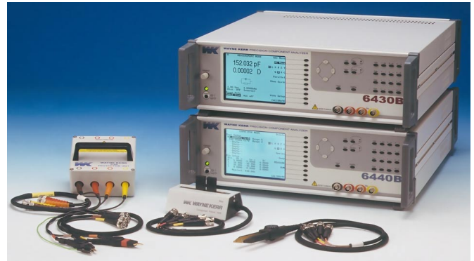
Accurate component analysis to 500 kHz (6430B) or 3 MHz (6440B) is simplified by many accessories which includes Overload Protection Unit 1J1100

The protection unit will protect the test equipment from up to 25 Joules of charged energy.